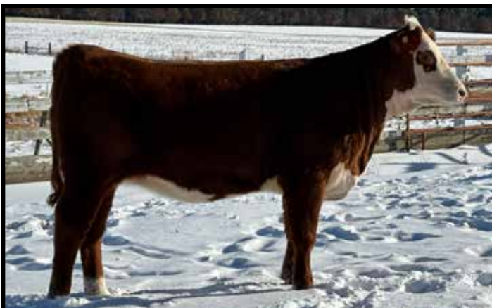
Lot 24 — Brookview 0036 Maggie 59M