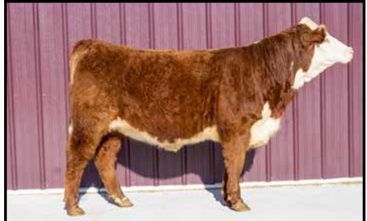
Lot 19 — KPH stella 139