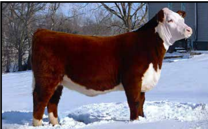
Lot 18 — PRR EK Sequin 623L ET

Consigned by: Holler Hereford Farm, Union Grove, WI 262-939-4286 or 262 210-4816