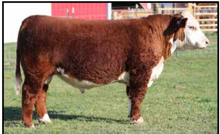
Lot 41 — MGM Vanguard Sensation 24L