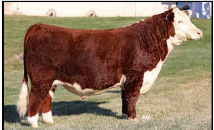
Lot 40 — TLA Gordon Garde LC 402L