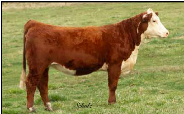
Lot 12 — DBS 504C Peggy Lou D20 L08

10 SF 8444 MONTGOMERY RAE 2359 (DLF,HYF,IEF,MSUDF,MDF,DBF) 44507456 Calved: 3/29/23 • Tattoo: LE 2359