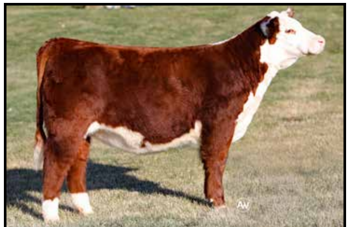
Lot 28 — TLA LC STFB Lana 312M

Consigned by: Lawin-Girls Livestock, Mineral Point, WI 608-482-4290