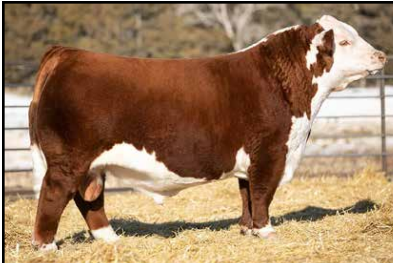
H WMS Thomas County 1443 ET — Sire of Lot 2