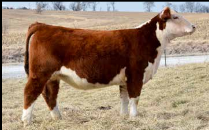
Lot 16 — PAW D87 Hello Darlin' 334