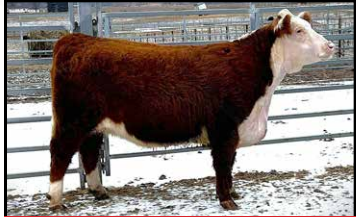
Lot 13 — PRR Willow 2L