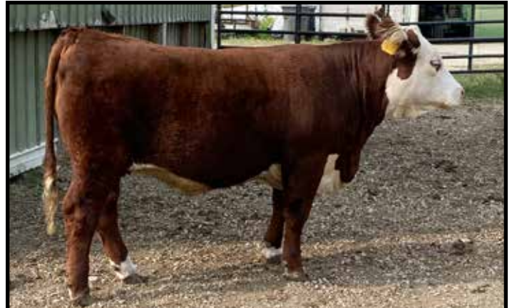
Lot 8 — BPH Trust 928G Amber 336L