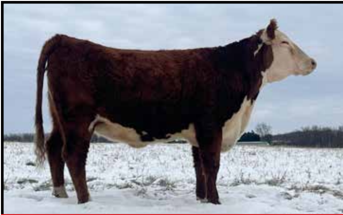
Lot 3 — 015 Bergman Farms 12L Lippy