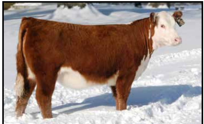
Lot 33A — PHH 025 Pearl 480 ET

Consigned by: Pierces's Hereford Haven, Baraboo, WI 608-434-0578