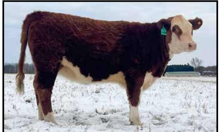
Lot 20 — K3 Bergman Farms 09M Magnolia