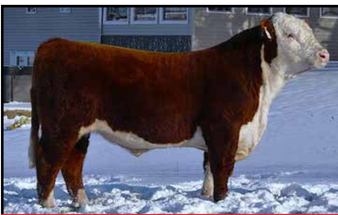
Lot 39 — PRR Artemis L16

We are offering a polled 2-year-old son of Trust. Charlie is deep bodied, thick muscle bull, that is very good on his feet. He has been used here with calves coming this Spring. Throughout his Pedigree they are all DNA tested and free. Don't miss out on giving Charlie a look. Consigned by: Baker Polled Herefords, Elkhorn, WI 262-903-0513