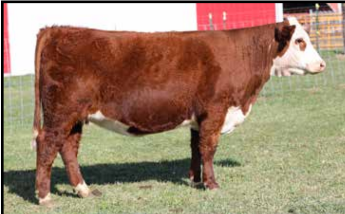
Lot 11 — MGM Vanguard GEM 14L