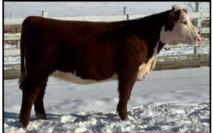
Lot 26 — Brookview 07K Mystique 93M

Consigned by: Boettcher's Brookview Acres, Fairchild, WI 715-828-7271 or 715-533-2470