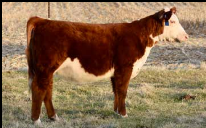
Lot 35 — PAW 601D Jewel 415