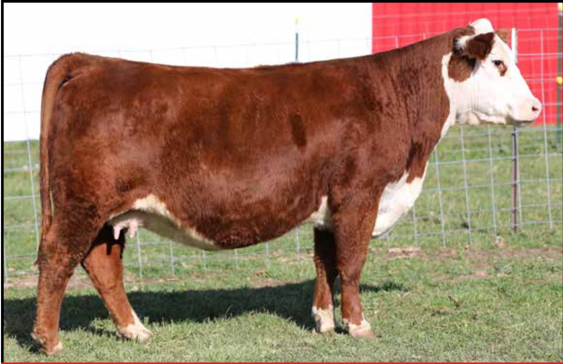
Lot 1 — MGM 730 Special Leader 28K ET