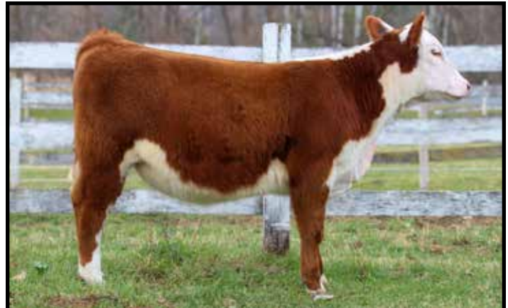
Lot 32 — SNL'S 8839 Sweet Freedom 17M