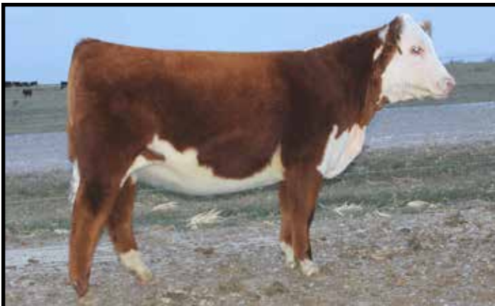
Lot 31 — SF 8444 Majestic Faye 2476 ET