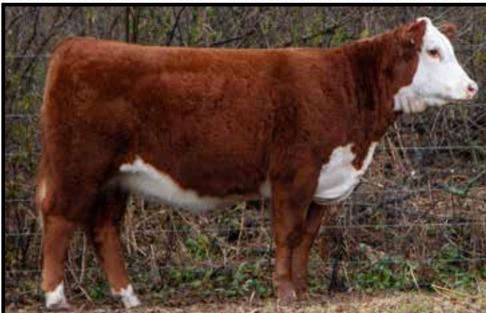
Lot 23 — WLC Steadfast 156J Stevie 401