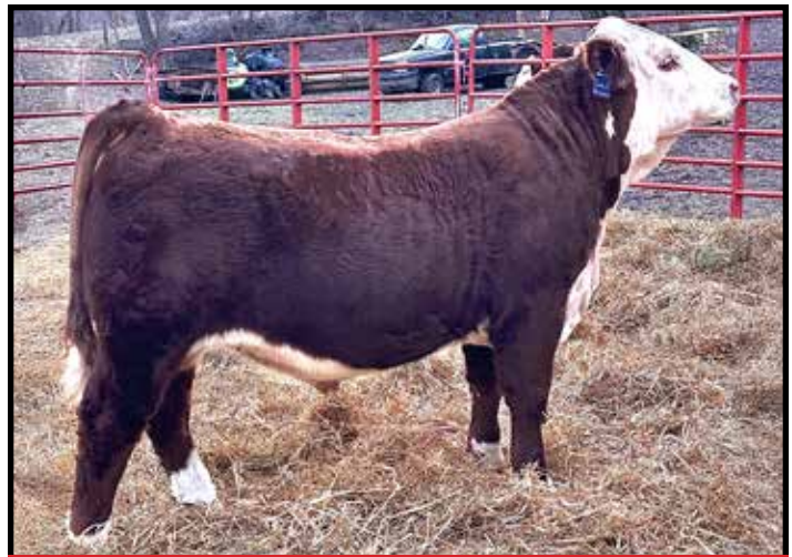
Lot 48 — JMP RJ Granite M4M