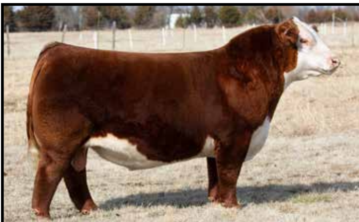
CH High Roller 756 ET — Sire of Lot 30