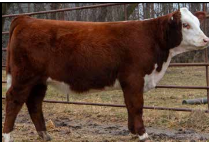
Lot 36 — WLC Desperado Sweetie 2296 404

Consigned by: PAW Livestock, LLC, Pleasantville, IA 515-450-7665