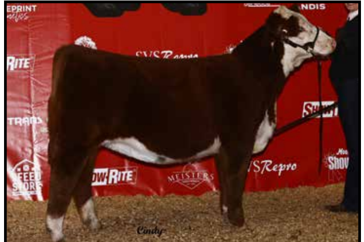
Lot 27 — FCCH Gentry Penny

Consigned by: Crooked Creek Herefords, Wonewoc, WI 608-350-9661 or 608-847-3530