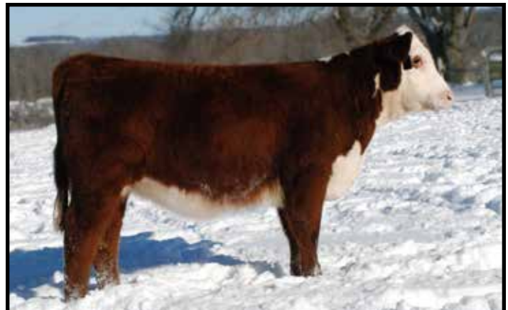
Lot 33B — PHH 025 Pearl 483 ET

Consigned by: Pierces's Hereford Haven, Baraboo, WI 608-434-0578