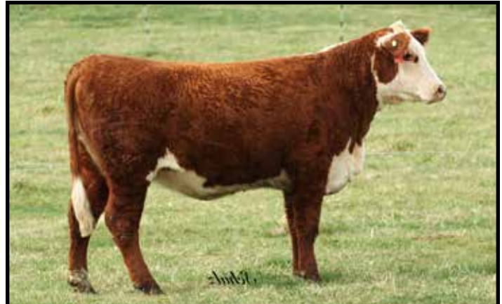
Lot 14 — DBS G060 Luann C12 L32