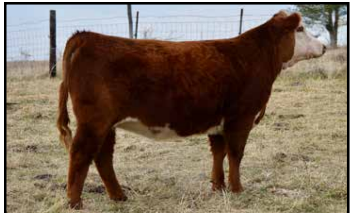
Lot 15 — PAW 446 Blessed Queen 333