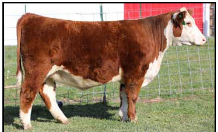
Lot 9 — 4LEAF Rutabaga 23A

Consigned by: Four Leaf Cattle, Hubertus, WI 262-719-6902