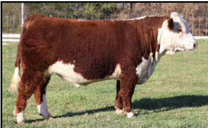
Lot 44 — Next Gen MGM Tremendous 2M