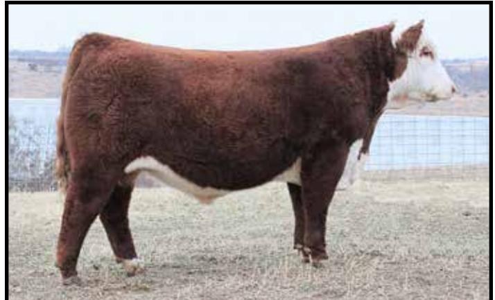
Lot 47 — LW 808 Venture 41M

Consigned by: Wirth Herefords, New Richmond, WI 715-377-6876