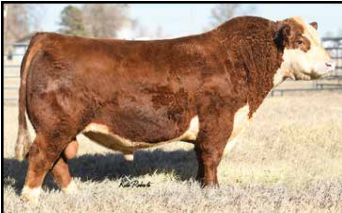
Boyd 31Z Blueprint 6153 — Sire of Lot 49