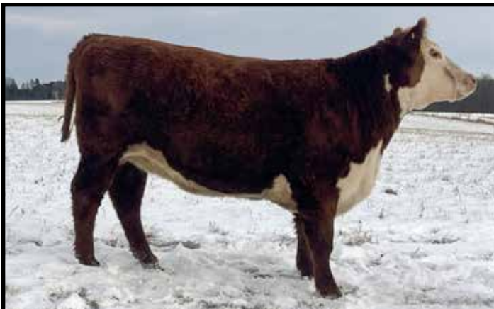
Lot 4 — 9119 Bergman Farms 01L Lizzy