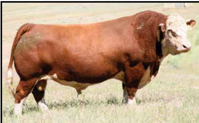
THM Durango 4037 — Sire of Lot 29