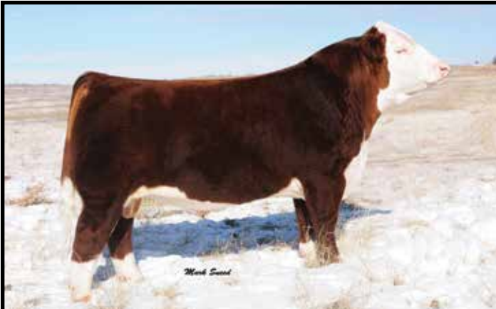
CRR About Time 743 - Sire of Lot 17

Consigned by: PAW Livestock, LLC, Pleasantville, IA 515-450-7665