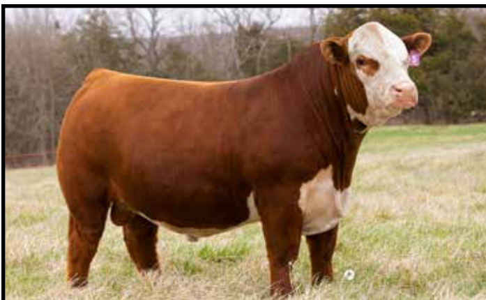
KSU Land Grant 153 ET— Sire of Lot 45