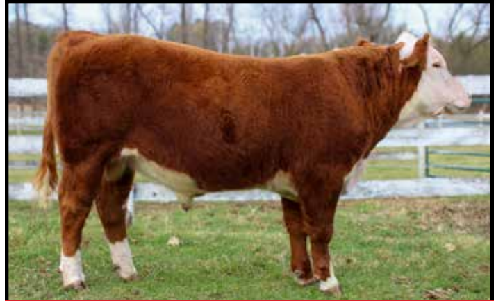
Lot 46 — SNL'S 6831 Freight Train M16

Consigned by: Steve & Loxi Smythe, Menomonie, WI 715-505-6510