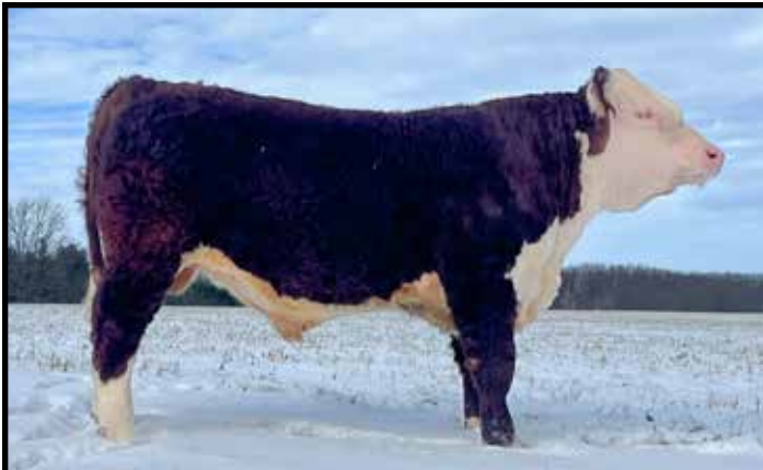
Lot 43 — 2028 Bergman Farms 05M Merica