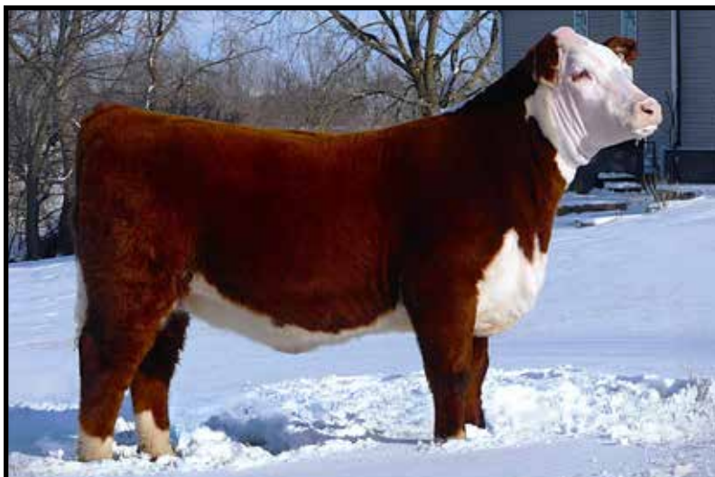
PRR EK Sequin 623L ET — Dam of Lot 2 (Sells as Lot 18)