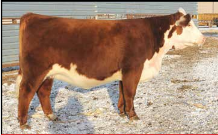
Lot 10 — SF 8444 Montgomery Rae 2359