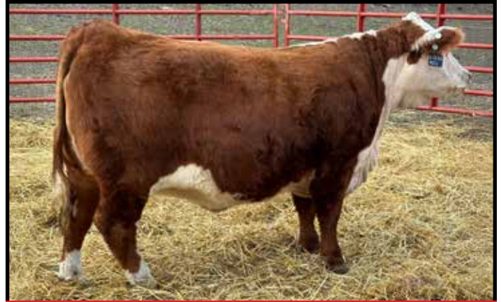
Lot 7 — JMP RJ Tequila Sunrise M2L