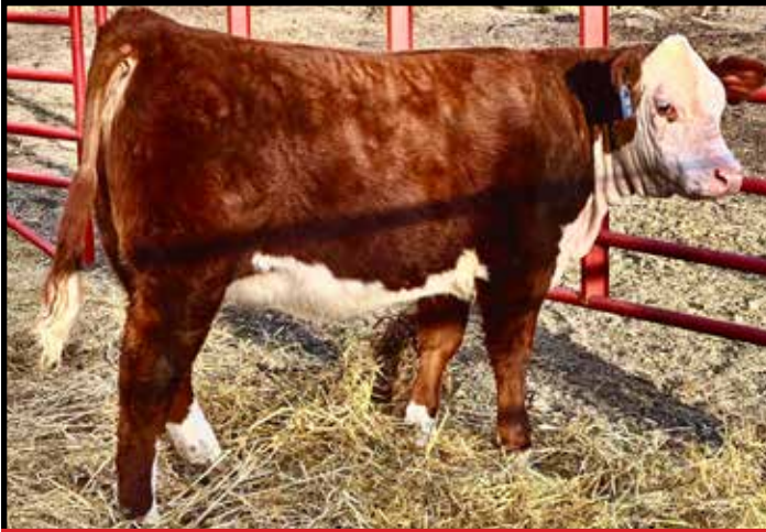
Lot 34 — JMP RJ Jane 5424 G13M

34 JMP RJ JANE 5424 G13M (DLF,HYF,IEF,MSUDF,MDF,DBF) P44558646 Calved: 5/4/24 • Tattoo: LE G13M