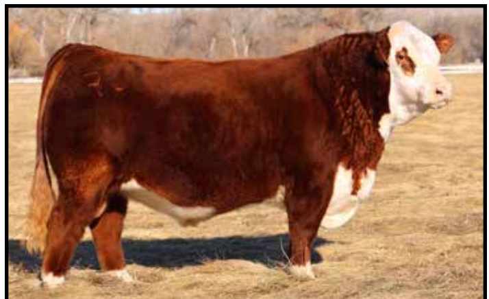
NJW 133H 6589 Manifest 87G ET - Sire of Lot 42