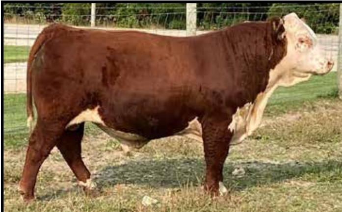
Lot 38 — BPH Trust 934 Charlie 329L

This Historic son is an outstanding herd bull prospect you don't want to miss! The trait leader Historic is the sire of the $75,000 Distinct bull that sold in the recent Huth dispersal sale. 403 has an awesome set of EPDs and would be great to use on heifers as well as your cows. He is thick, pigmented, and structurally excellent. Check him out you won't be disappointed Consigned by: J&J Polled Herefords, Hartford, WI 262-573-4019