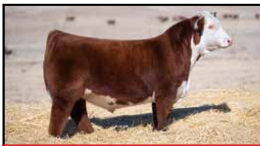
ECR Copper Candi 1333ET – Sire of Lot 2C

Consigned by: Plum River Ranch Monroe, WI (608.214.1154) Eric