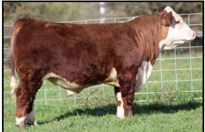
Lot 43 - MGM Sensational Leader 26K