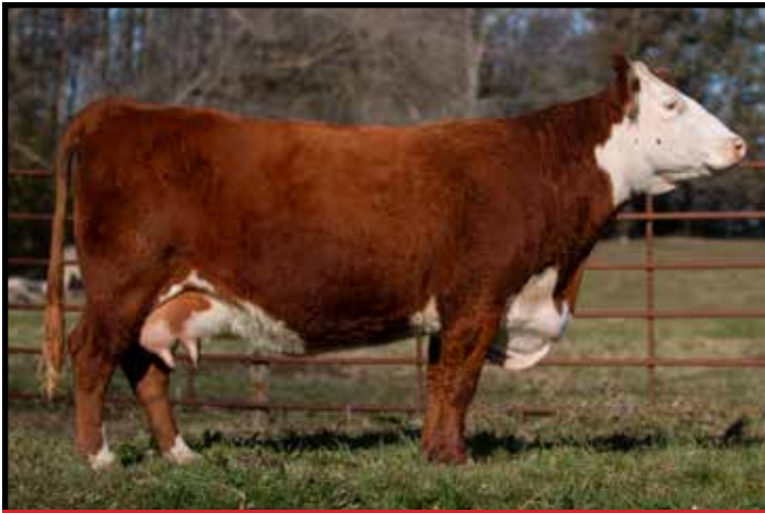
Lot 3 - WLC 63E Shirley