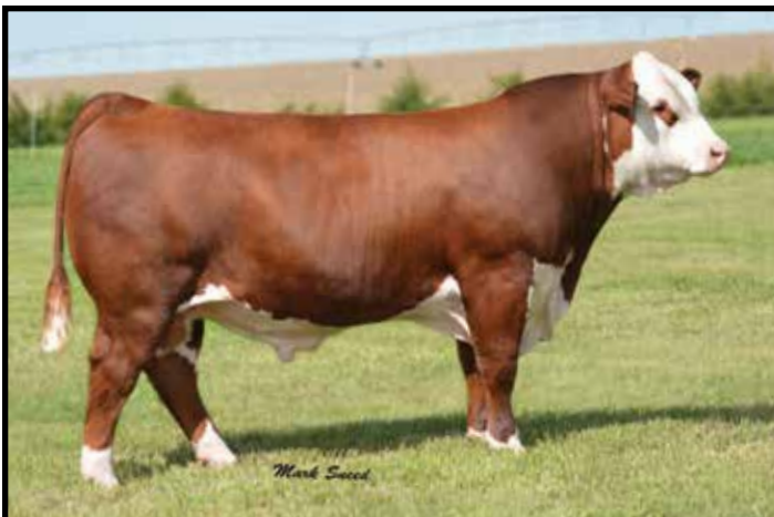
R Leader 6964 - Sire of Lot 28

Consigned by: Boettcher's Brookview Acres Fairchild, WI (715.828.7271) Butch