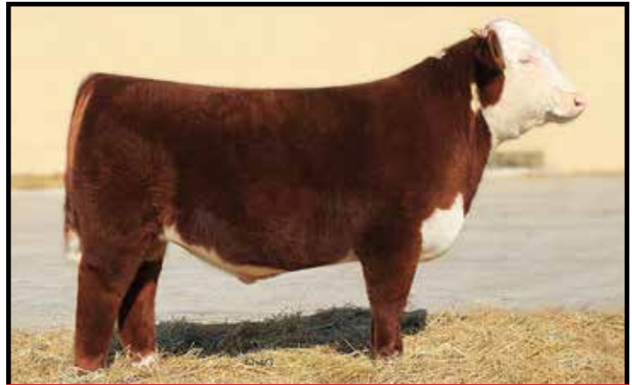
K Rustic 711 ET – Sire of Lot 36