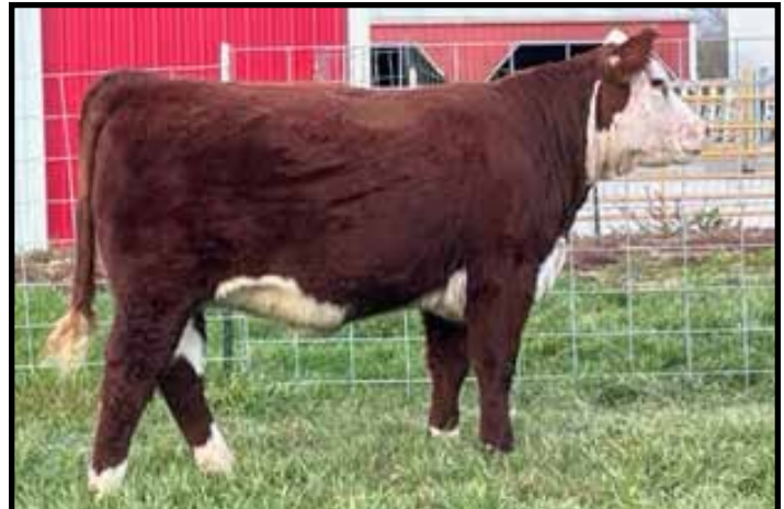
Lot 19 – MGM Vanguard 730 Special 23K