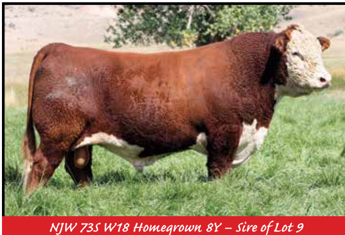
NJW 73S W18 Homegrown 8Y - Sire of Lot 9