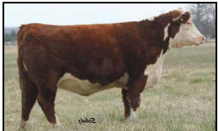
Lot 14 - Huth G017 Destini K017

Consigned by: Huth Polled Heredords Oakfield, WI (920.251.0281) Jerry