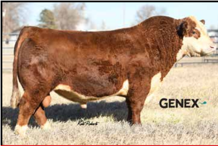
Boyd 31Z Blueprint 6153 – Sire of Lot 45