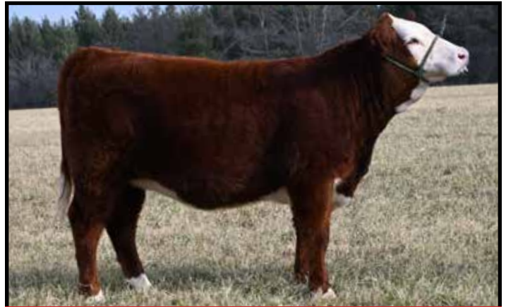
Lot 24 - 45J Bergman Farms 13L Luann