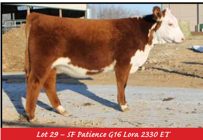
Lot 29 - SF Patience G16 Lora 2330 ET