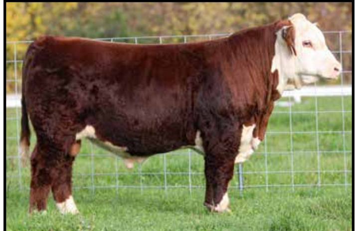
Lot 42 - MGM Vanguard Quantum Leap 18K