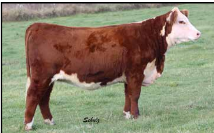
Lot 17 - ESS G060 Caliente E088 K35