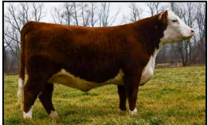
Lot 6 - C&L Miss Magnolia 15E 1K ET