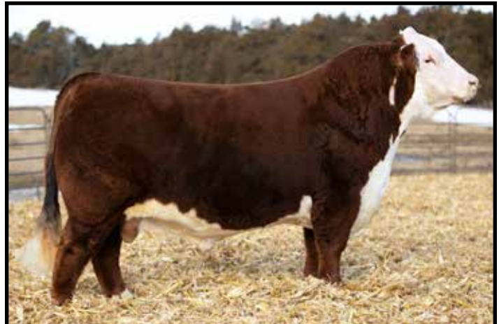
H Montgomery 7437 ET – Sire of Lot 37