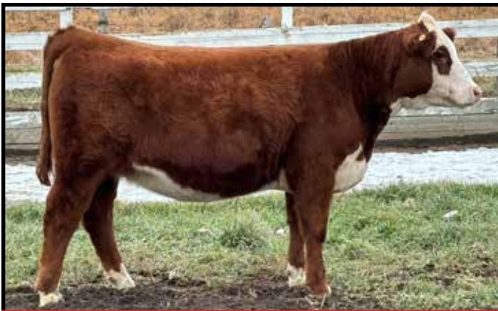
Lot 27 - Brookview 0036 Legacy 57L