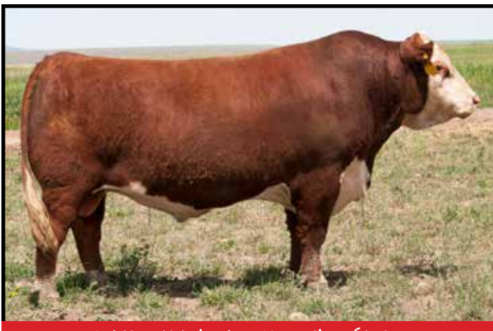
MPH 10H Juice Box Z3 – Sire of Lot 47

Consigned by: Spaeth Farms Cadott, WI (715.289.4098)