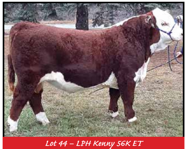
Lot 44 - LPH Kenny 56K ET