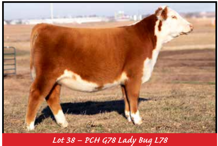
Lot 38 – PCH G78 Lady Bug L78