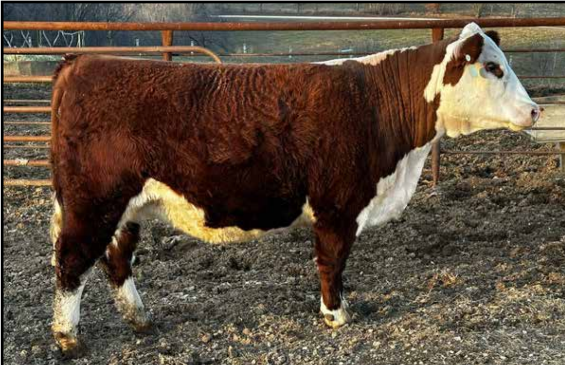
Lot 1 – CBF Laney K10