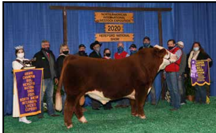
SSF KKH 26Z Ribeye 801 ET - Sire of Lots 34 and 35