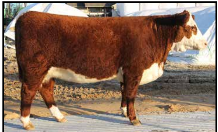
Lot 7 - SF 5048 Red Baron Tilly 2208

Consigned by: Spaeth Farms Cadott, WI (715.289.4098)