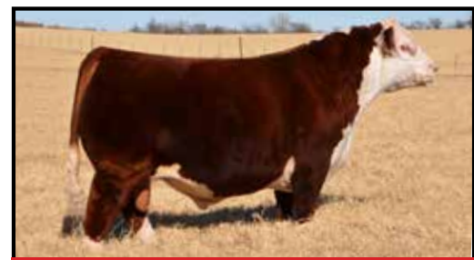
KLD RW Marksman D87 ET – Sire of Lot 2D