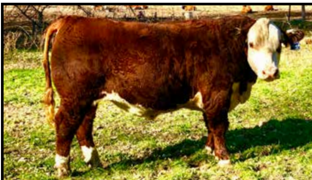
Lot 41 – JMP Polly's Redemption N13K