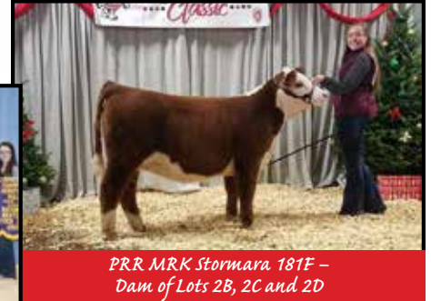
PRR MRK Stormara 181F – Dam of Lots 2B, 2C and 2D