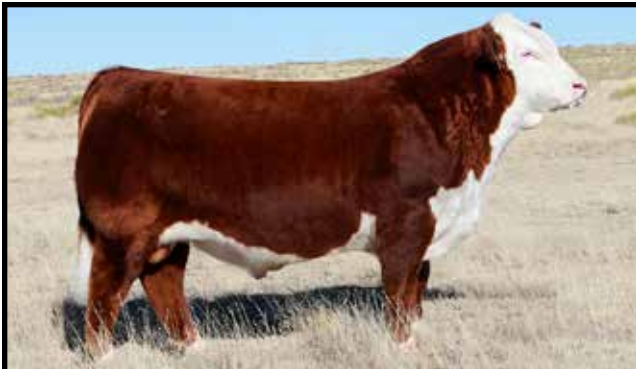
NJW 79Z 22Z Mighty 49C ET – Sire of Lot 39