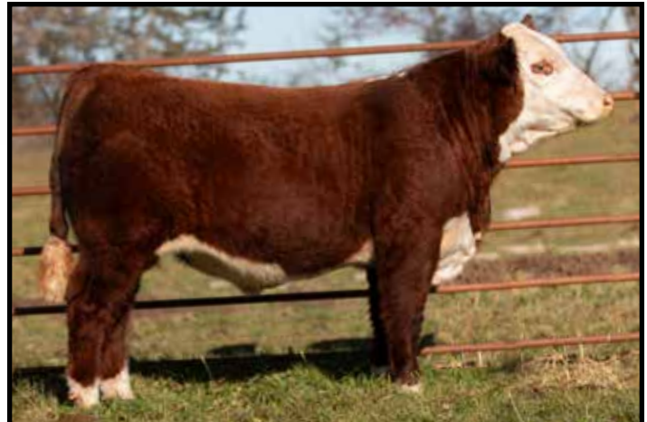
Lot 48 - WLC Long Haul 36E Kyle 301