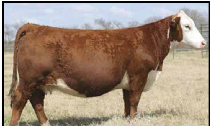
H PG Savannah 5568 ET - Dam of Lot 50

Consigned by: Meier Cattle Company Gratiot, WI (608.482.3218)