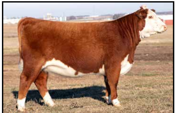
Lot 20 – PCH Miss All Mighty K48