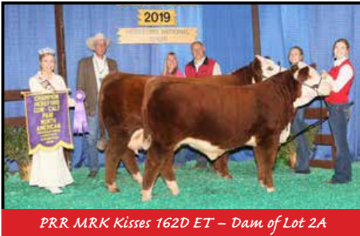
PRR MRK Kisses 162D ET – Dam of Lot 2A