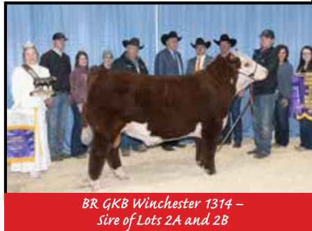
BR GKB Winchester 1314 – Sire of Lots 2A and 2B