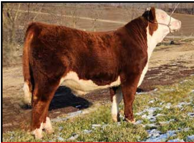
Lot 51 – PRR Artemis L16