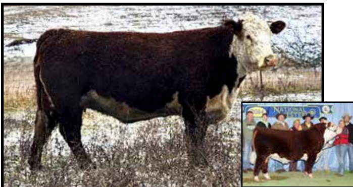
Lot 4 - PRR MRK Investor Gal 204H ET