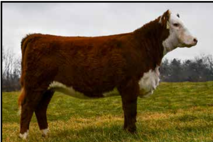
Lot 22 - C&L Miss Aurelia 15E 12L