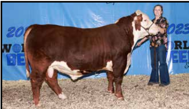
Lot 40 – HGF MD Jewels Miles K14 ET