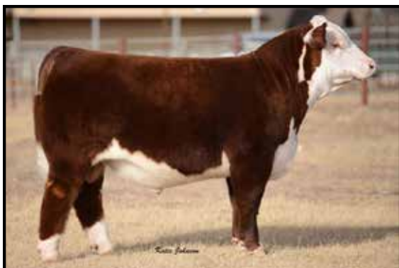
H FHF Authority 6026 ET – Sire of Lot 51