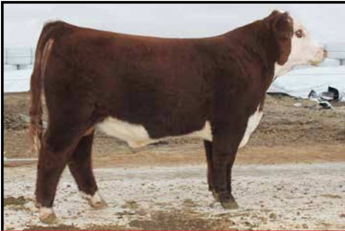
Lot 46 – SF 1806 Victor 2312