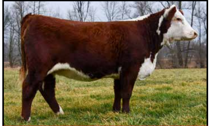
Lot 11 - C&L Miss Vivian 7694 28K