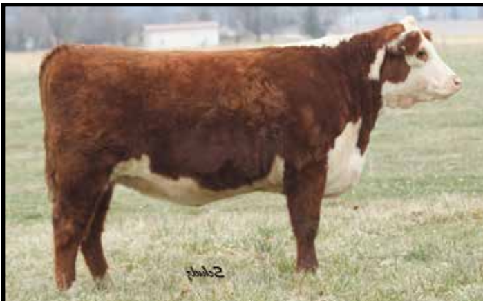
Lot 15 - Huth B076 Destini K034