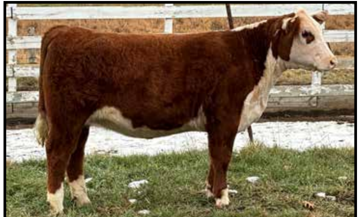
Lot 25 - Brookview 254G Logan 39L

Consigned by: Boettcher's Brookview Acres Fairchild, WI (715.828.7271) Butch