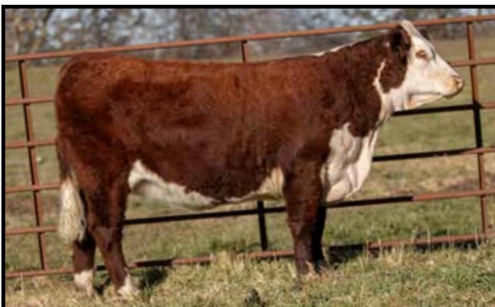
Lot 16 - WLC 2296 Sensational Sally 222