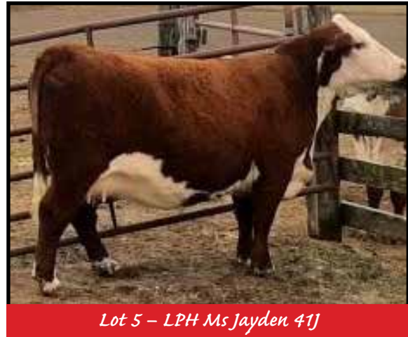
Lot 5 - LPH Ms Jayden 41J