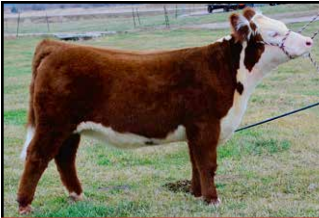
Lot 21 - MKP Miss Dior HA022