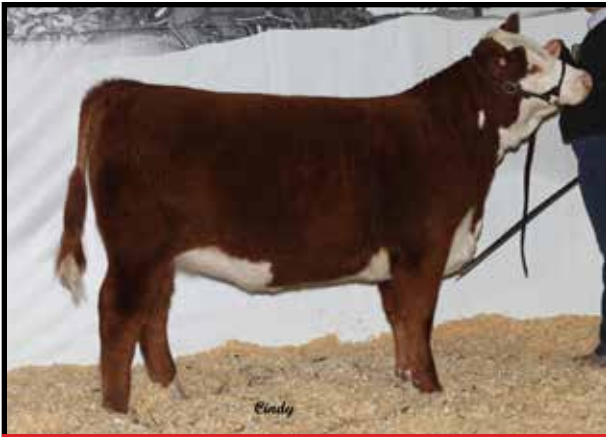
Lot 33 - FCCH Authority Fern 0331L